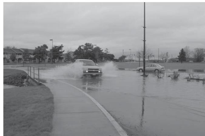
The north parking lot on the main campus flooded in January after heavy rains and runoff pushed debris into the culvert that runs under the roadway, plugging it.