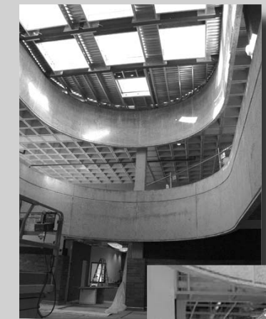
The open atrium area outside the bookstore will soon be replaced by a courtyard with an enclosed ceiling housing six skylights (left). HOWE (below) and the bookstore (bottom) are in the final stages of completion.

The bookstore's new tentative move date is the week of Dec. 18. The bookstore will be closed Dec. 18–Jan. 1 for the move, and will be back in business Jan. 2.